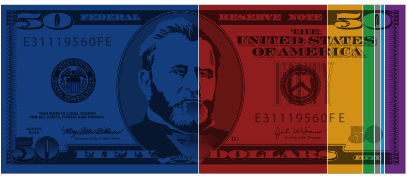
Copyright ©2019 National Council of Nonprofits (www.nonprofitimpactmatters.org)

8.7% DONATED Individuals 2.9% DONATED Foundations 1.5% DONATED Bequests 0.9% DONATED Corporations