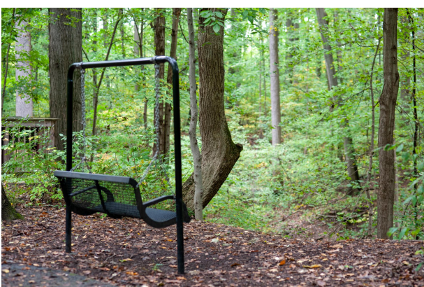
See here for a tour of Historic Buchanan photos and references