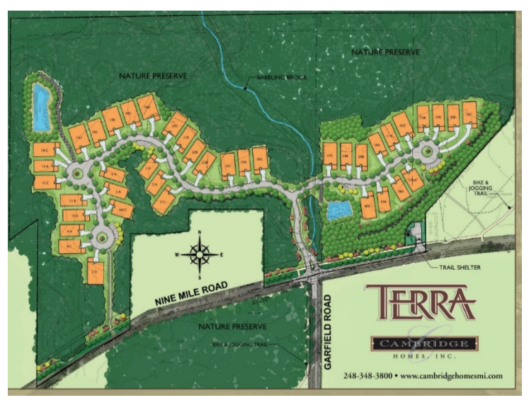
Figure 3: Terra Site Plan