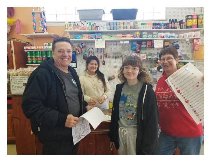
EDC Board Members Visit Los Arcos Market

from city staff or other planning professionals and evolve into effective question and answer sessions. Workshops are a great way to educate the community surrounding a specific topic and hear concerns, questions, and ideas.