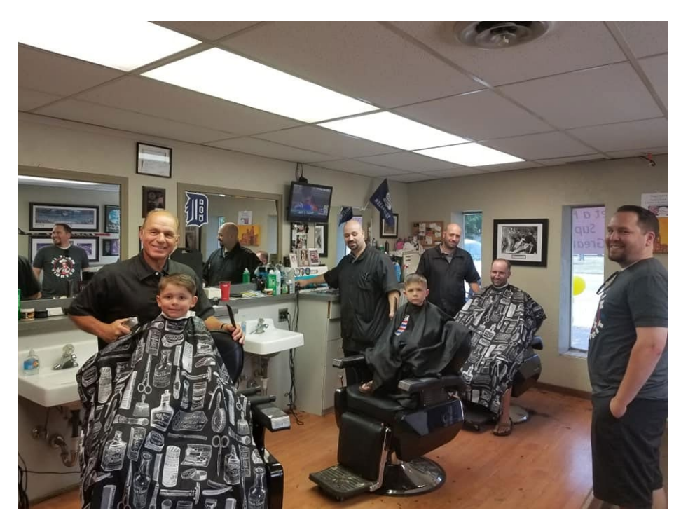
Patrons Enjoy a Haircut in Lincoln Park's Downtown Corridor

The Michigan Planning Enabling Act can be accessed through the following link: <u>http://legislature.mi.gov/documents/mcl/pdf/mcl-Act-33-of-2008.pdf</u>