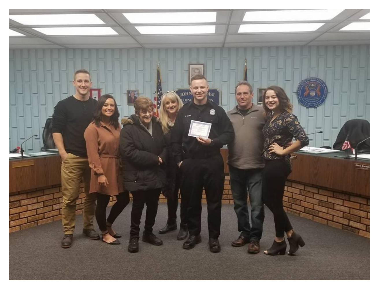
Residents Receive Recognition for Their Outstanding Service to the City of Lincoln Park

Instituting effective evaluation processes benefits all members of the Lincoln Park community by enhancing transparency and improving process performance. While Lincoln Park's current evaluation strategy is still in development, prioritizing mechanisms that empower crossdepartmental collaboration and review will strengthen the city government's ability to fully deliver responsive service to constituents.