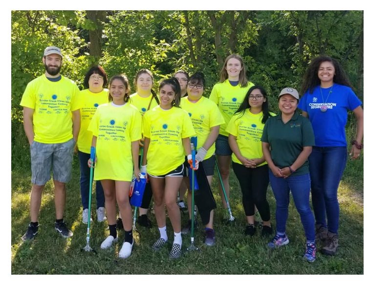
Lincoln Park High School students help clean up Ecorse Creek

can help to narrow concepts or get a specific opinion on a topic. Stakeholder groups make ideal participants of focus groups. Standing committees are one type of focus group, that repeatedly meet based o