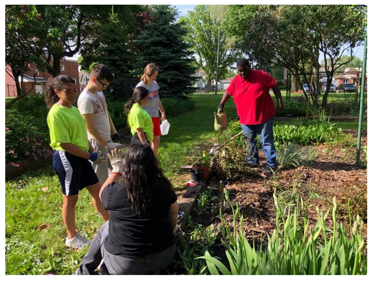
The Lincoln Park Green Team refreshes the foliage outside of city hall

City of Lincoln Park Office of City Management 1355 Southfield Rd., Lincoln Park, MI 48146 313-386-1800 ext. 1231 <u>citymanagement@citylp.com</u>