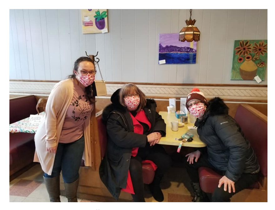
Lincoln Park city staff and representatives meet at Park Restaurant

groups. Standing committees are one type of focus group, that repeatedly meet based on the needs of a community. They are perfect for engaging with concerned residents, underrepresented groups, or groups that may have specific needs in the community, such as students or seniors.