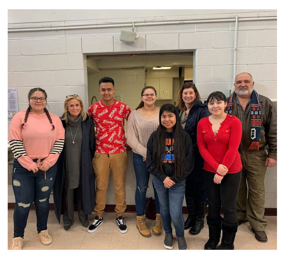
Mayor Karnes and Lincoln Park High School Students Meet With U.S. Representative Debbie Dingell

This plan is designed to develop and maintain staff expertise in all aspects of public participation. It will serve as a guide to inform and support participation, as well as a tool for training new staff on the basics. This plan also contains state and local regulations that staff must follow regarding public participation. The city encourages staff to continually improve the methods used to meet the public need for information and involvement