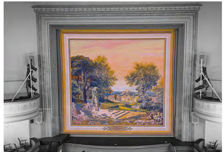
Front Drop Curtain - "A Grove Near Athens" by Walter Burdige