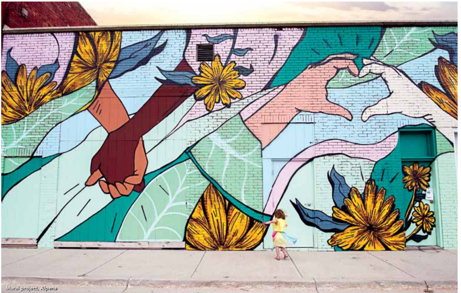
Mural project, Alpena