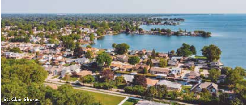
St. Clair Shores