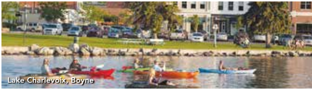
Lake Charlevoix, Boyne

Rogers City's partnership with Michigan Main Street has brought an energy to our downtown that we haven't experienced in a great many years. Empty spaces are filling up, storefronts are decorated, bright, and welcoming, great new events with a focus on arts and culture have brought foot traffic, smiles, and excitement. We have a fantastic Main Street executive director who is making positive things happen daily, aided by an engaged Main Street board and a growing army of fabulous volunteers. While there is plenty of work to do, we have forward momentum and a flashing arrow pointing toward a better tomorrow. It's just been really, really cool to be a part of.