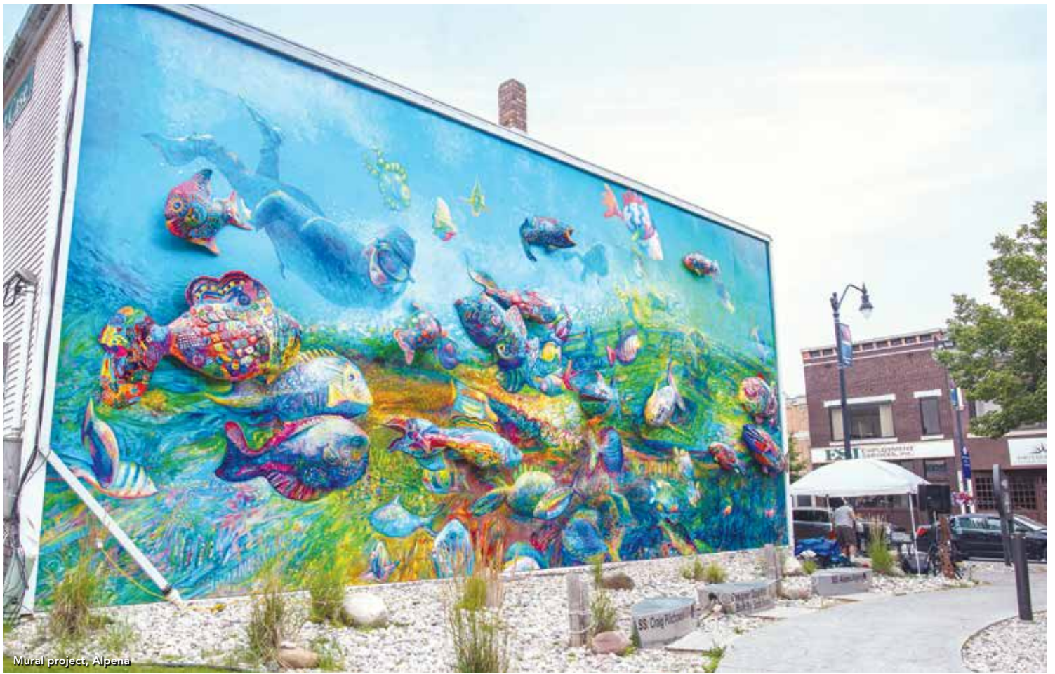
Mural project, Alpena