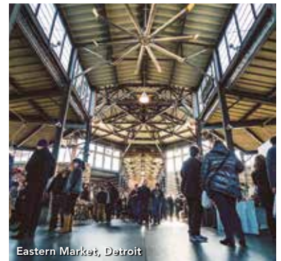
Eastern Market, Detroit