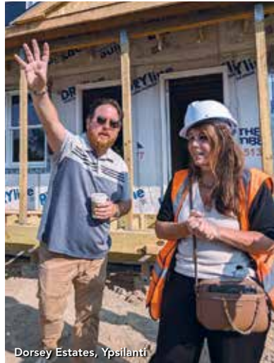
Dorsey Estates, Ypsilanti