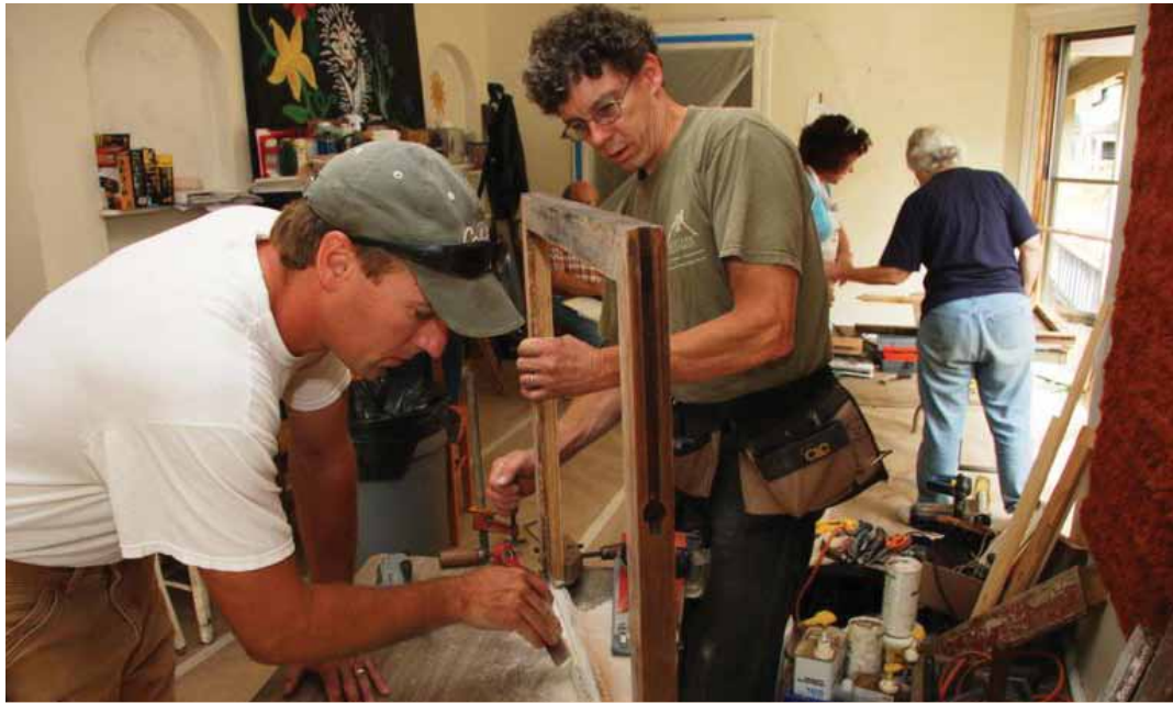
Rehabilitated existing wood windows are energy efficient and sustainable.

Some of these so-called "green" measures could therefore do more harm than good to a historic property and to our environment. Historic preservation is important to incorporate into our long-term planning for a more sustainable future.