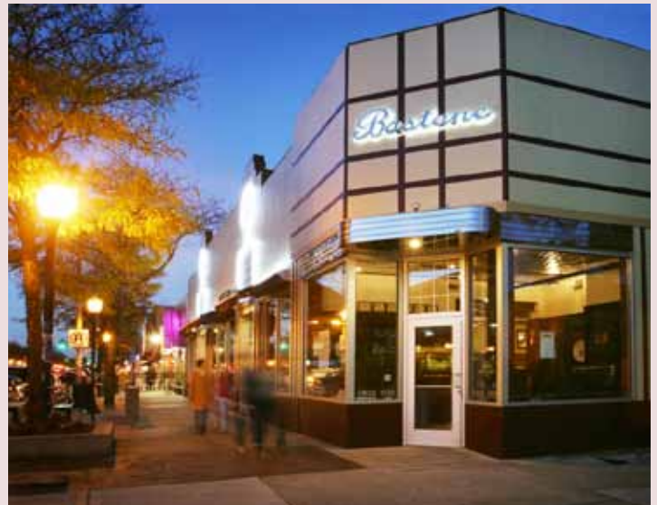
Royal Oak's former B & C Grocery was rehabilitated and now houses a variety of restaurants.