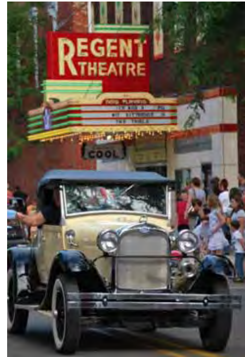
The historic Regent Theater and its surrounding neighborhood imbue downtown Allegan with character and a strong sense of place.