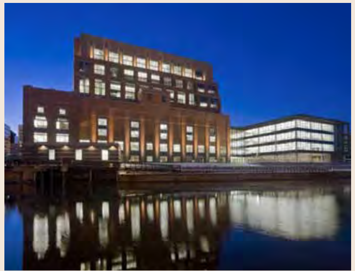
The rehabilitation of 811 Portland in Calumet (right) and the Ottawa Street Power Station in Lansing (above) were among six projects recognized with Governor's Awards for Historic Preservation.