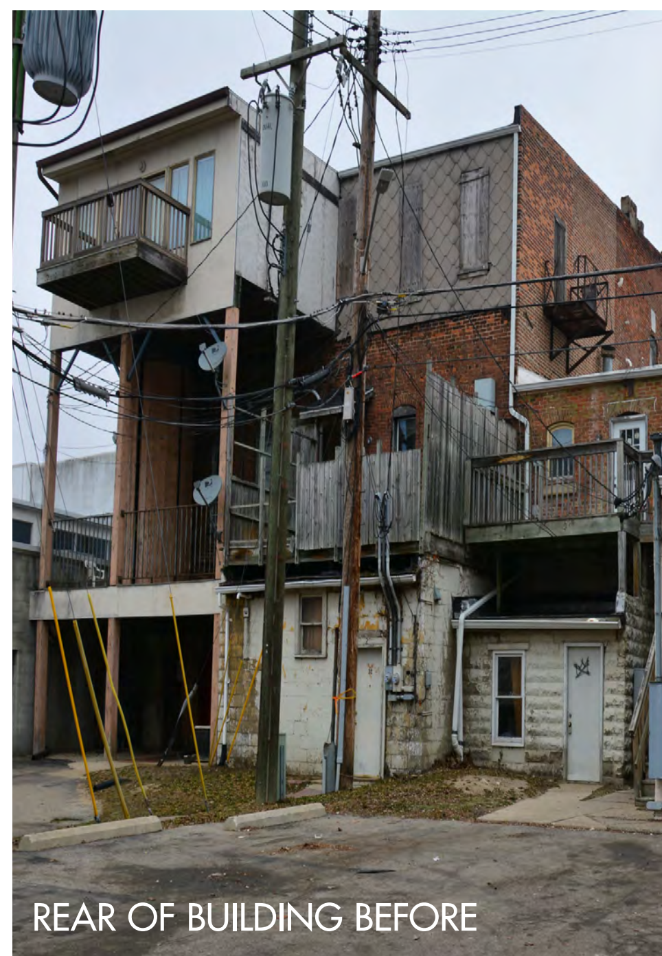
REAR OF BUILDING BEFORE