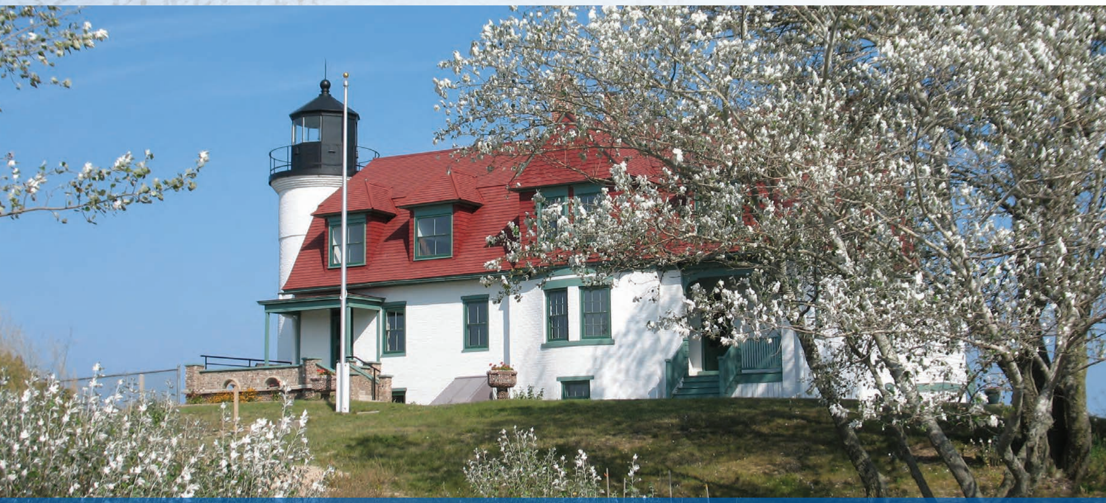
The rehabilitation of the Point Betsie Light Station, Frankfort