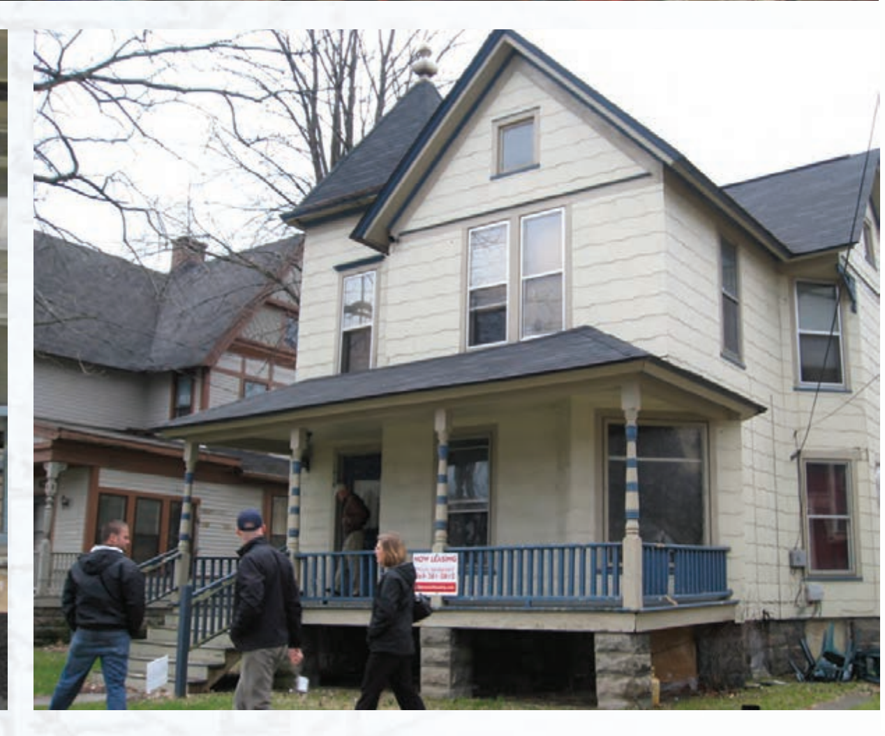
The City of Kalamazoo and the Michigan Historic Preservation Network

The current emphasis on energy efficiency and the need to re-train workers converged to convince the city of Kalamazoo, the Michigan Historic Preservation Network (MHPN), and the State Historic Preservation Office (SHPO) that Michigan needs more professionals who know how to repair existing wood windows.