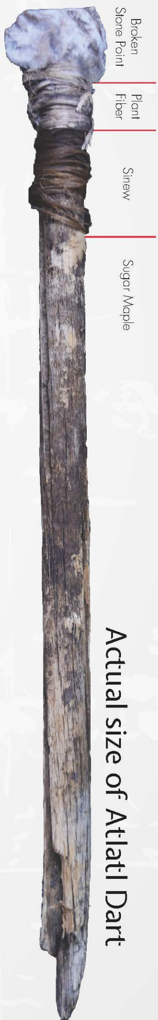
Actual size of Atlatl Dart

The atlatl is a simple tool. It is commonly a straight piece of wood roughly two feet long with a shallow groove along the length of the upper side in which to lay the shaft of the dart, and a raised "stop" at the end against which the butt of the dart is placed. The atlatl effectively lengthens the thrower's arm allowing the dart to be propelled with much greater force than a spear can be thrown by hand. As a rough comparison, a spear thrown by hand might achieve a velocity of around 60 miles per hour. With an atlatl, a spear can be thrown at about 115 miles per hour.