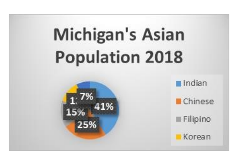
2018 State Fact Sheet – Michigan. AAPI Data. Asian and Pacific Islander American Vote.

The United States census lumps a host of ethnic populations under the label Asian. Some of the many different cultures that make up that category include Indian, Filipino, Chinese, Laotian, Korean, Vietnamese, and Japanese. Michigan's Asian population is the fastest growing immigrant population in the state, increasing 39 percent between 2000 and 2010. A majority of Michigan's 287,881 Asians live in southeast Michigan with 44 percent located in three counties: Oakland, Wayne, and Washtenaw. The city of Hamtramck has the largest concentration of Asians at 24 percent of the city's total population. Cities with the fastest growing Asian populations are Auburn Hills, Novi, and Springfield.