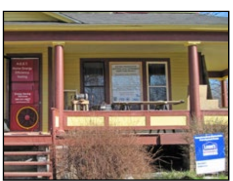
Blower door test house, Kalamazoo. CLG grant project. State Historic Preservation Office.