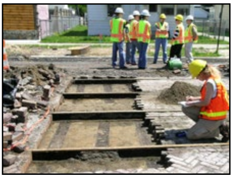
Assist communities in identifying the historic resources and features that contribute to their "sense of place"

a. Encourage the identification of historic resources in Michigan's communities.