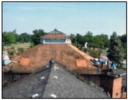
Belle Isle Aquarium roof rehabilitation, Detroit. State Historic Preservation Office.