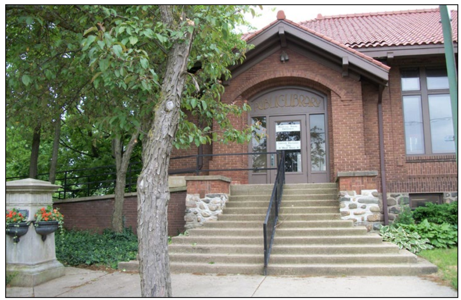
Allegan Library. State Historic Preservation Office

As of 2013, Michigan had a total of 23 Certified Local Governments (CLG). A program of the National Park Service, the CLG program's purpose is to help local communities enrich, develop and maintain local preservation programs. The State Historic Preservation Office is required to provide 10 percent of its federal Historic Preservation Fund dollars to CLGs via a pass-through grant program. CLG grants have served Michigan communities well. Though the grants are relatively small, they have proven to be catalyst grants that help initiate and complete large projects.