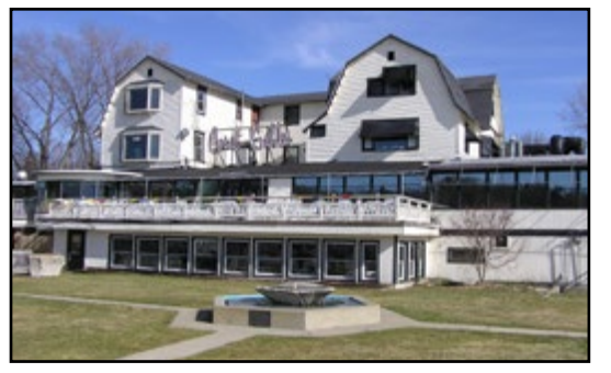
Leindecker's Inn (Coral Gables), Saugatuck. State Historic Preservation Office.