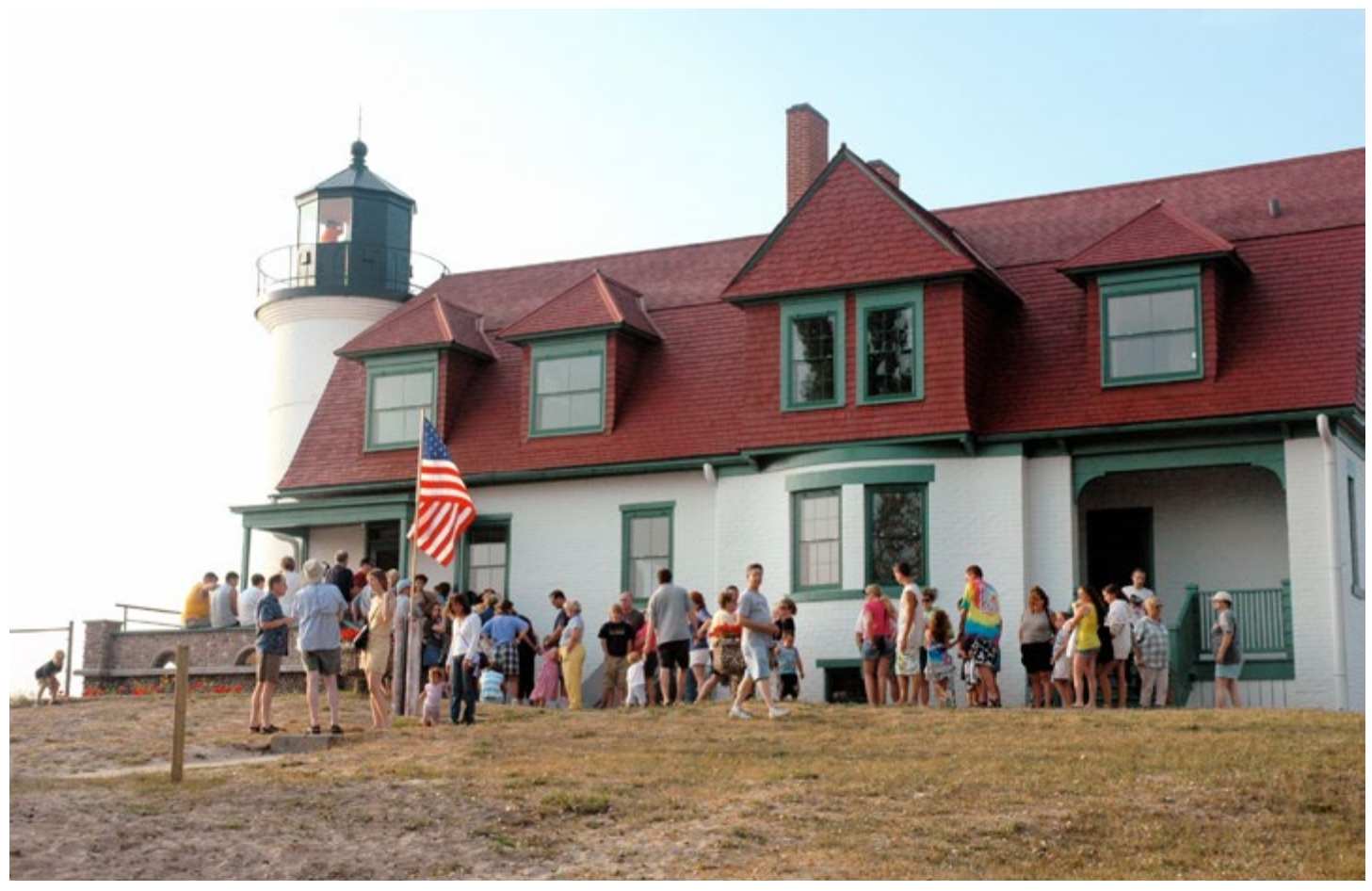
Point Betsie Light Station.

Which more than 120 lighthouses along its 3,200 miles of shore line, Michigan has more lighthouses than any other state in America. Established in 1999, the Michigan Lighthouse Project brought a variety of organizations together to assist in the transfer of these unique resources from federal ownership to local organizations. The Michigan Lighthouse Fund was established with proceeds from the sale of specialty automobile license plates to provide funding to help preserve and protect lighthouses. Between 2008 and 2013 more than $877,500 in grants were awarded to 30 projects ranging from rehabilitation work to the development of plans and specs and historic structure reports.