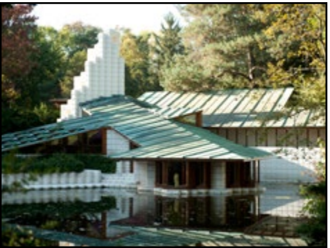
Alden B. Dow Home & Studio, Midland.