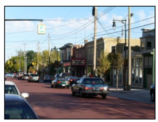
Wealthy Theatre Historic District, Grand Rapids. State Historic Preservation Office.

Michigan's villages, towns and cities contain some of the state's most striking architecture. Listing in the National Register of Historic Places enables property owners in a designated district to utilize Federal Historic Preservation Tax Credits to rehabilitate historic buildings. National Register listing can also be used in tourism promotion. Downtowns recently listed on the National Register include: