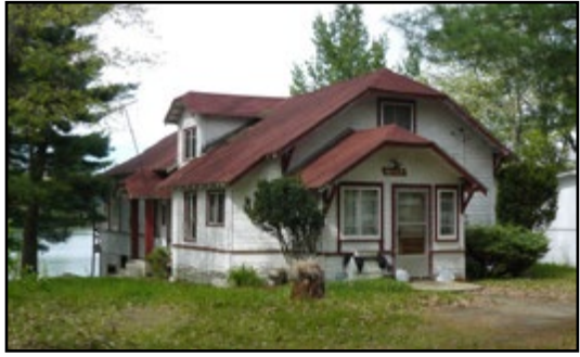
Idlewild Historic District, Baldwin vicinity. State Historic Preservation Office.