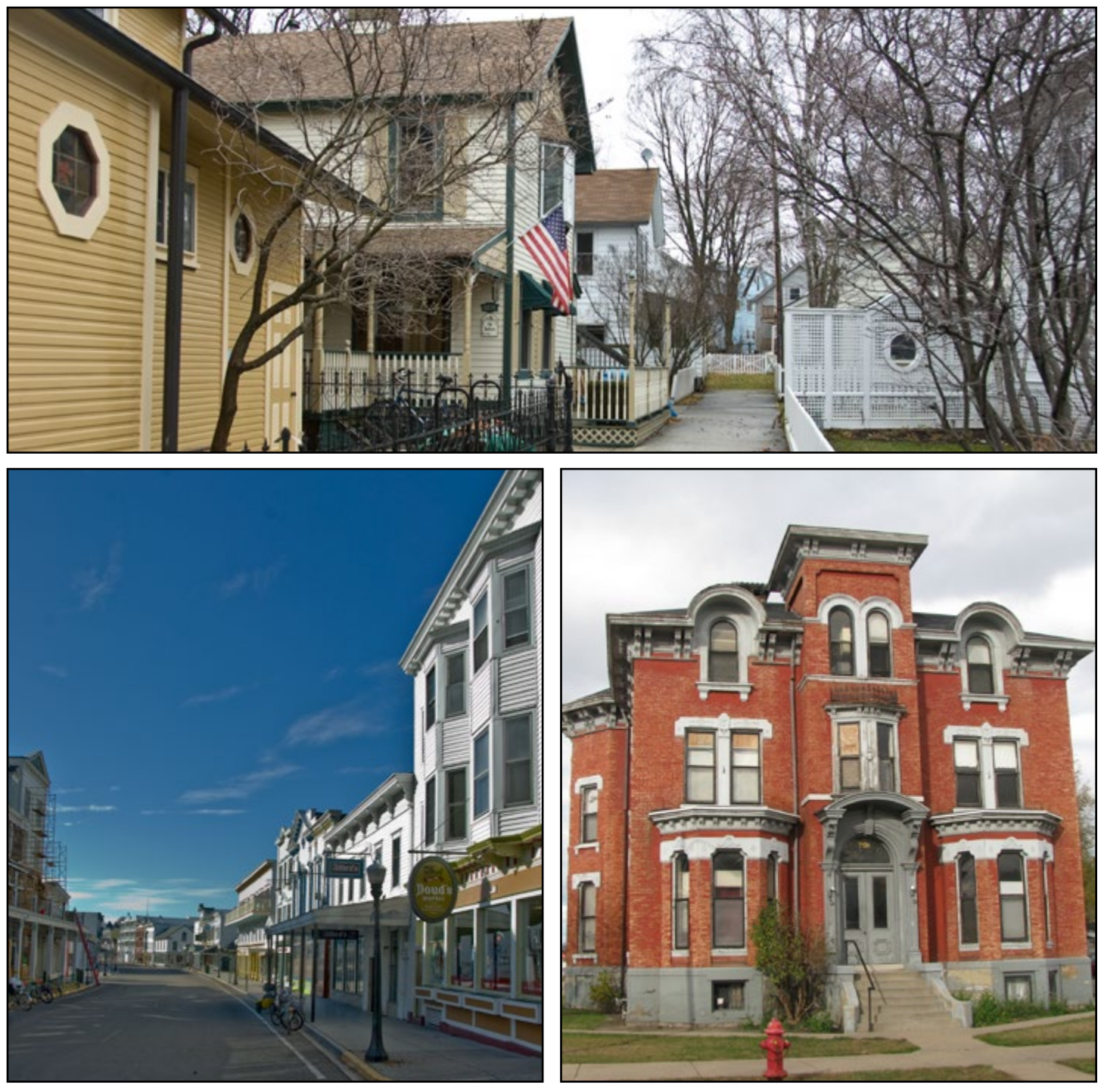
Top: West End Local Historic District, Mackinac Island. Photo: Past Perfect. Bottom left: Main Street Local Historic District, Mackinac Island. Photo: Past Perfect. Bottom right: Center Avenue Local Historic District, Bay City. Photo: Commonwealth Cultural Resources Group, Inc.

I n Michigan, local historic districts provide one of the few means of protecting historic resources. A community can adopt a local historic district ordinance and appoint a historic district commission to review projects to the exterior of buildings in a designated local district. The first step to establishing a local historic district is appointing a historic district study committee that researches the history of the district, completes a resource inventory and writes a report. Between 2007 and 2013, SHPO received 79 historic district study committee reports from communities across Michigan.