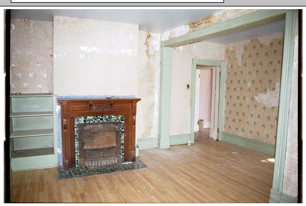
Photo # and date Name of Property Direction of View Description of View Photo Name