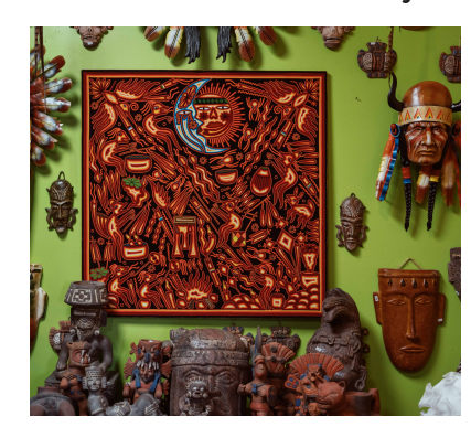
Michigan Main Street Story Series | Page 1

My grandparents always wanted to educate themselves and others. We want to draw people in, and even if you don't buy anything, you can come here and learn about different places in Mexico. It's a country so rich in culture and history.