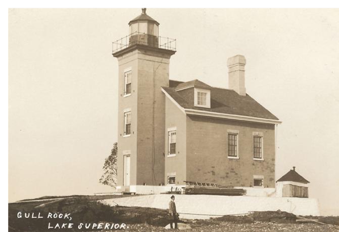
Gull Rock Light Station in 1908