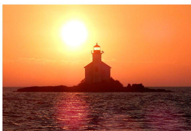
Lake Superior Sunrise