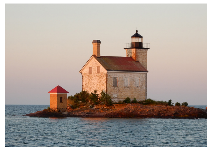
Gull Rock Light Station in 2017