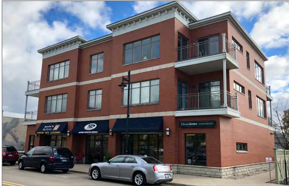
408 Eagle Street in South Haven, Mich., is an example of a three-story mixed-use building with traditional architectural design elements that is respectful of the historic character of the downtown district.