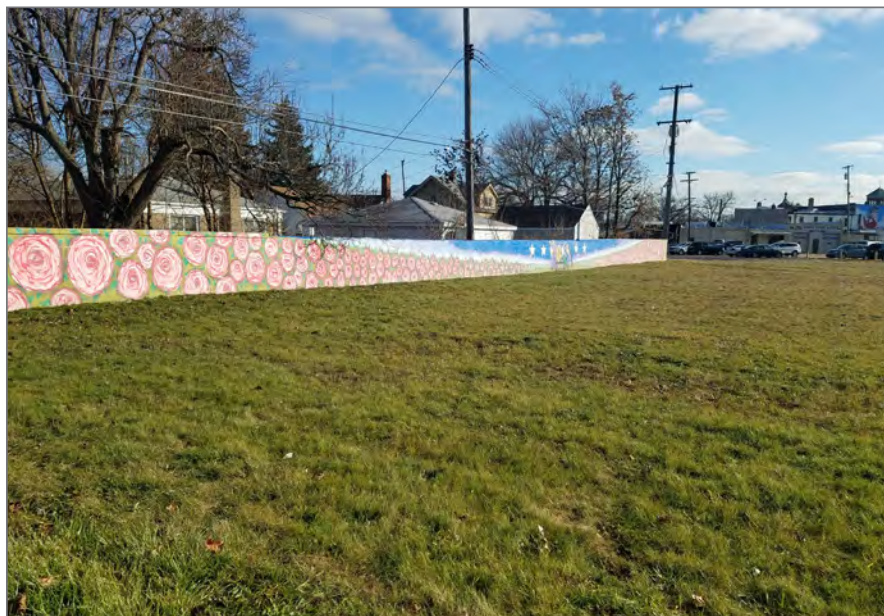
Ground-level view of the subject site looking south. Utica Road is on the far right of the photo, and the rear of the existing historic commercial buildings lining Gratiot Avenue are in the background. Utica Road will undergo streetscape improvements in 2019 which will rebuild the sidewalk to include attractive lighting, public seating, and bump-outs for parallel parking.