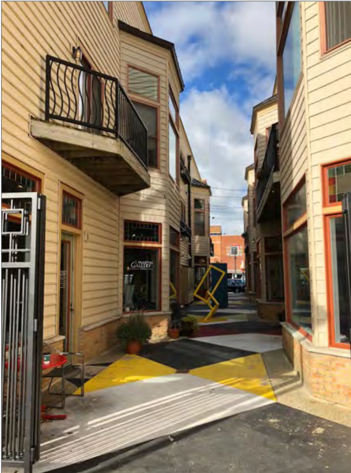
406 Phoenix Street in South Haven, Mich., has creatively incorporated a pedestrian pass-through and public art displays into a downtown, mixed-use development.