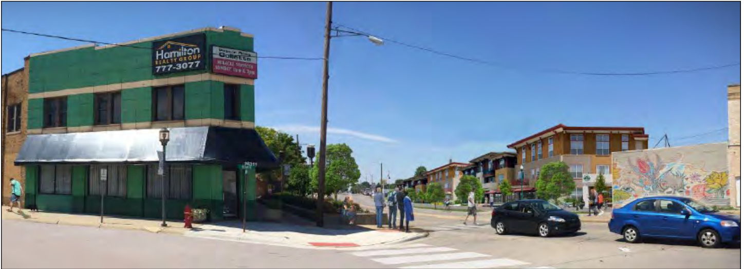
28392 Utica Road viewed from the corner of Utica Road and Homer Street. This rendering by Peter Allen Associates shows one potential vision for new mixed-use development on the site.