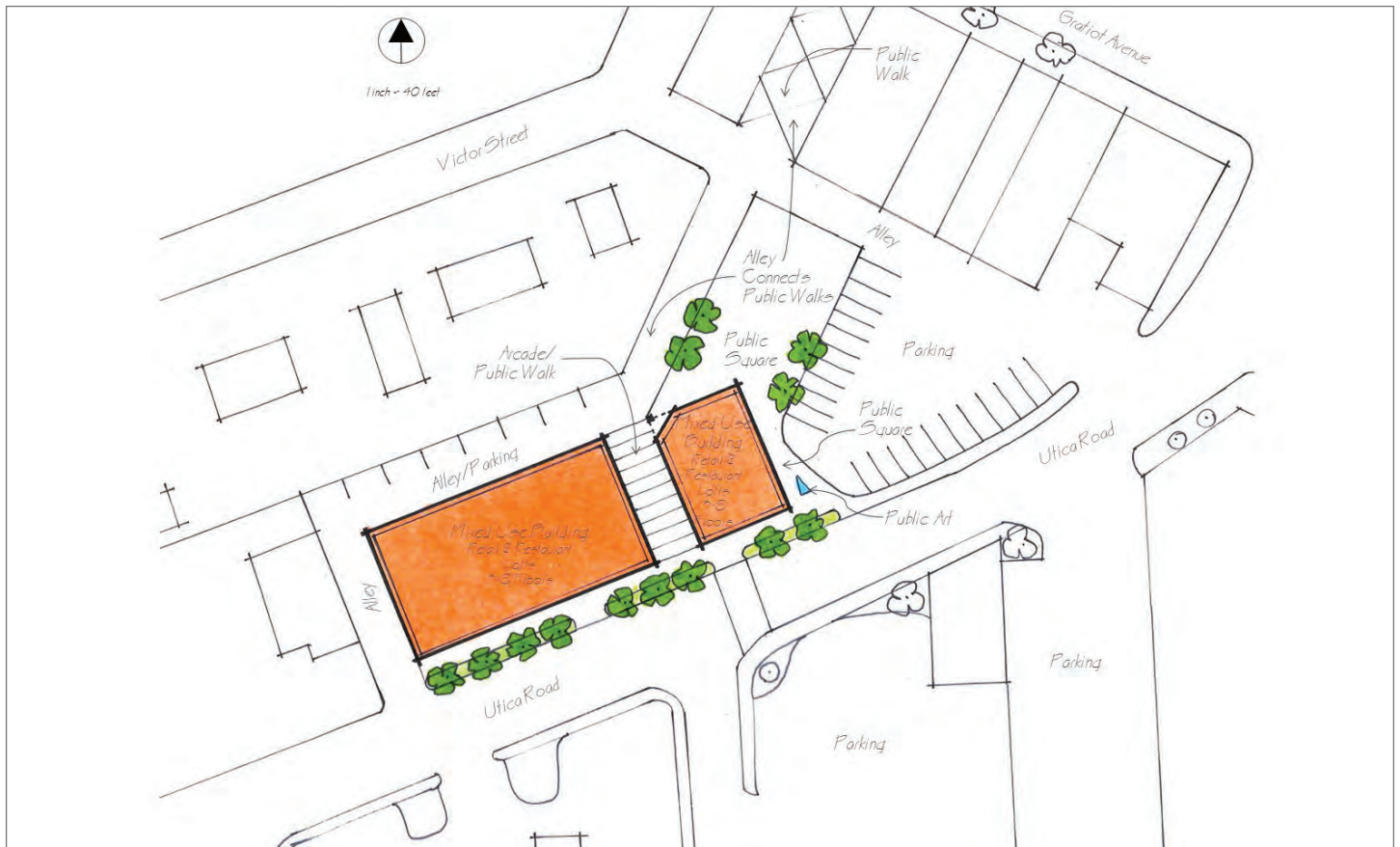
Pair of 3–8 story mixed-use buildings integrated with pedestrian connection to Gratiot Avenue, and space for display of public art on site.

Again, all of these images are intended to be illustrative, and the city is eager to consider alternative approaches that advance the goals for the site and fit the neighborhood context.