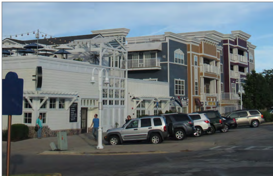
Light Harbor Preserve in New Buffalo, Mich., is an example of a new mixed-use development in a historic town center.