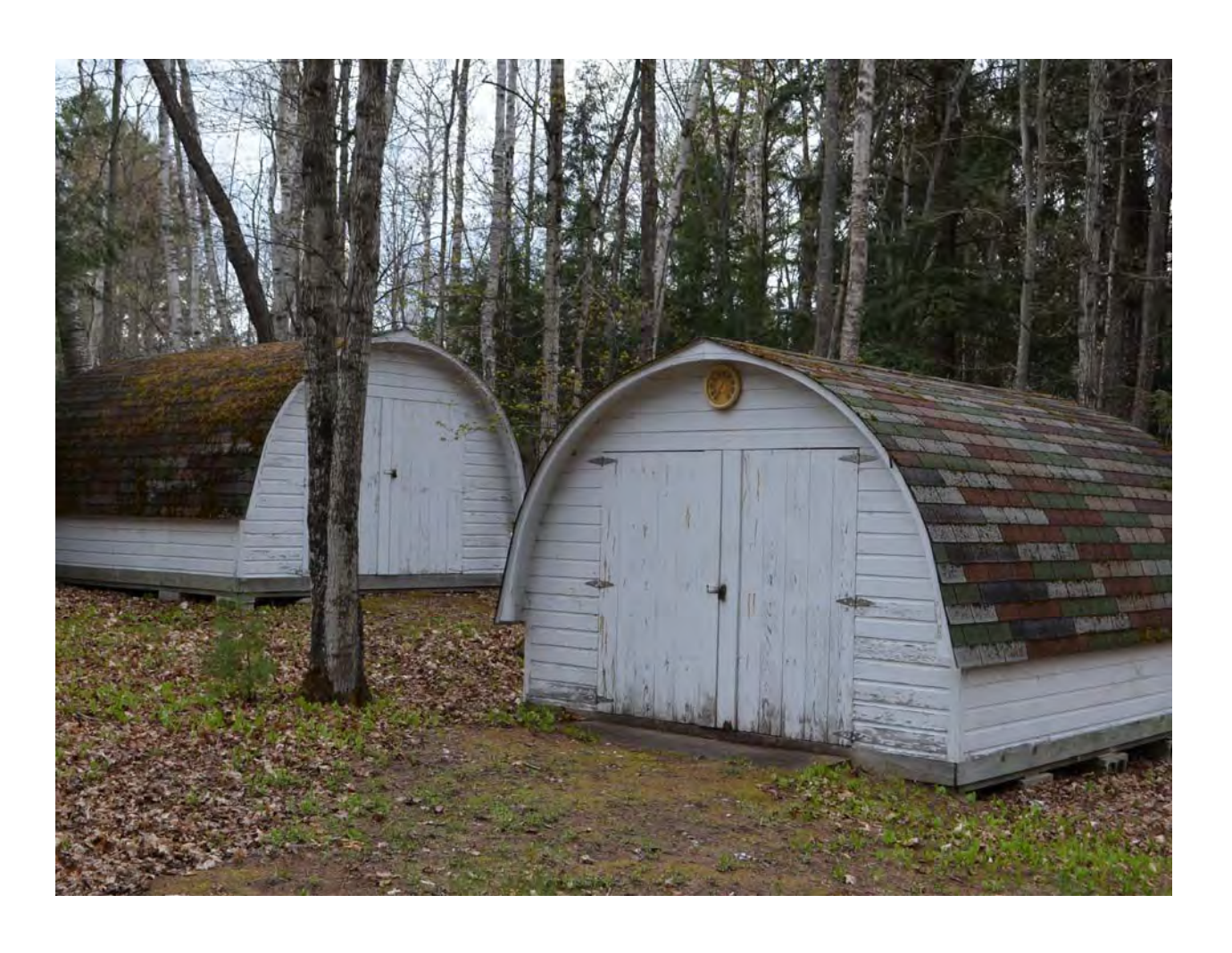
THE MICHIGAN ABOVE-GROUND SURVEY PROGRAM