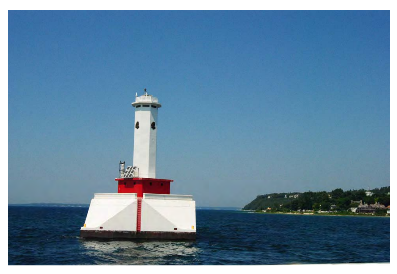
VISIT US AT WWW.MICHIGAN.GOV/SHPO