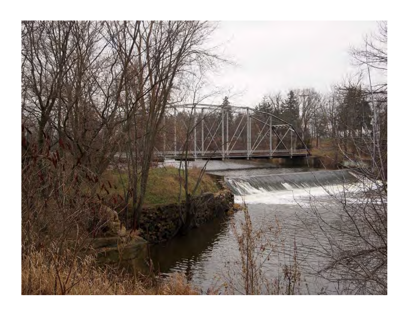
SURVEY PLANNING AND FIELDWORK