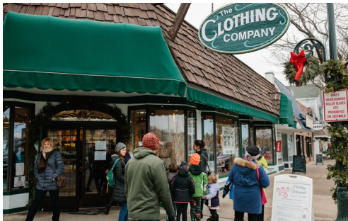
Merchant Open House & Hot Cocoa Contest