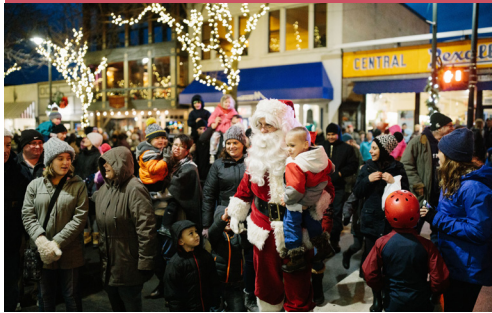
Holiday Parade and Tree Lighting