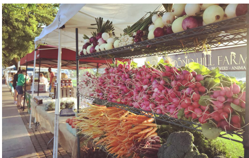
Charlevoix Farmers Market