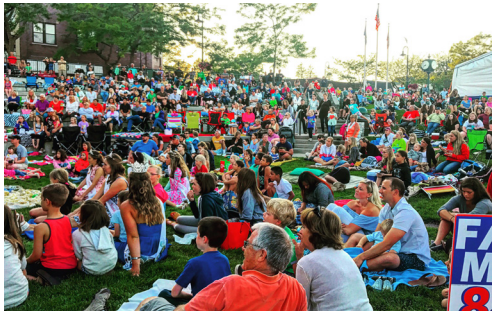
Main Street Monday during Venetian Festival