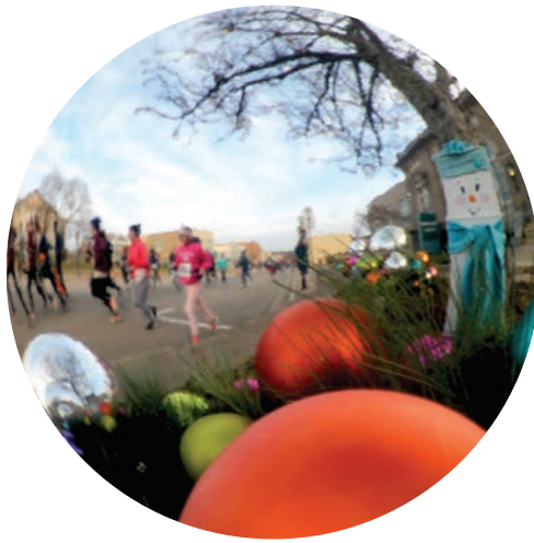
Turkey Trotters through downtown reflected in our mini bean.