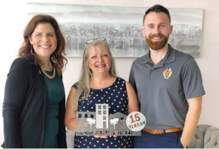
Celebrating 15 years with Michigan Main Street