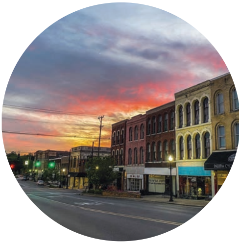
Sunset over Main Street.