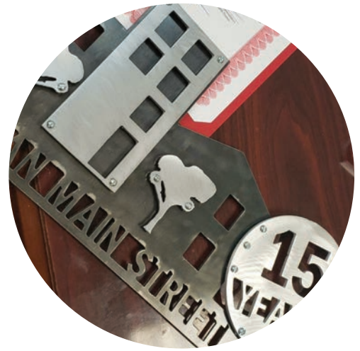
Fifteen years as a proud Michigan Main Street community!