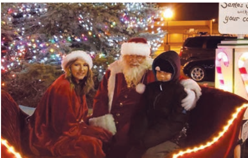
Santa at the tree lighting