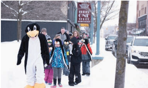
March of the Penguins