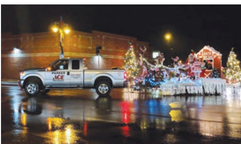
Parker's Parade of Lights