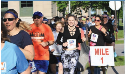
Rock the Locks 5k