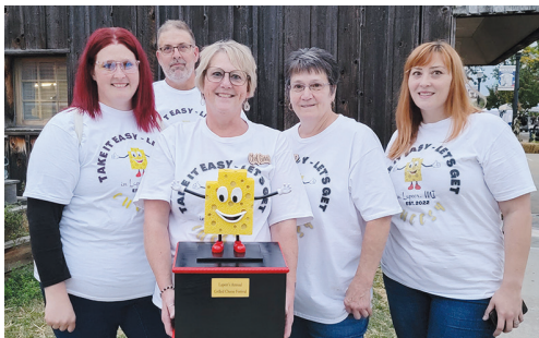
2022 Grilled Cheese Fest champions, Chef G's

"Michigan Main Street and all of their tools, educational resources, and access to financial support has helped us add vibrancy and revitalization in the downtown we couldn't have done ourselves."