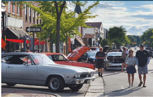
Lapeer Cruise on Nepessing Street