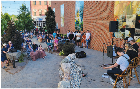
Frame 42 rocking the summer concert stage