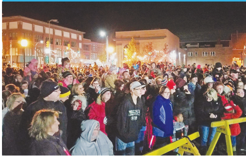
Owosso Glow brings our community together