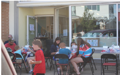
Sesquicentennial Event: Birdhouse Painting