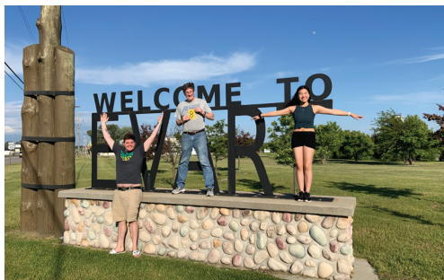
Sesquicentennial Event: Scavenger Hunt

"The Michigan Main Street Organization helps Evart to connect and network with other communities throughout the state and country. It also connects us with many resources we could not otherwise access."