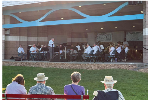
Summer Concert Series