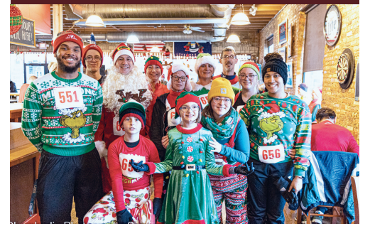
Scrooge Scramble 5K