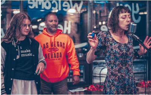
Arts Night Out