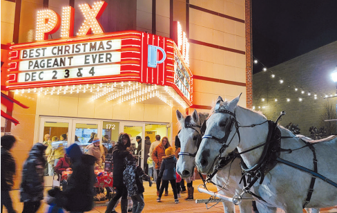
Annual WinterFest Celebration