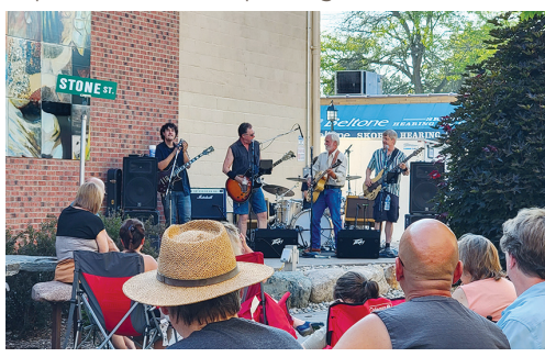
Summer Concert Series