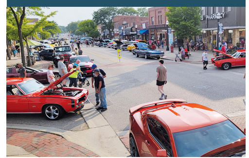
Lapeer Cruise on Nepessing Street