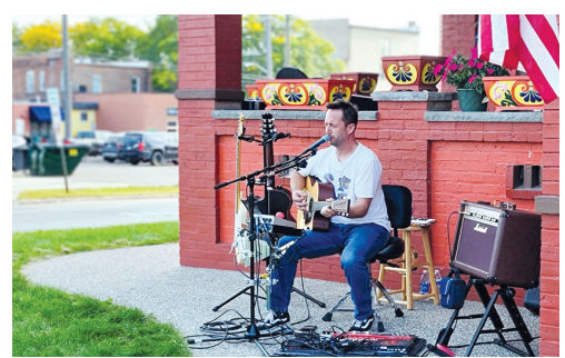
Lapeer's Second Annual PorchFest

"By using the tools and resources given to us through Michigan Main Street, we are able to turn someone's aspirations and goals of opening a brick-and-mortar business, into their American Dream."