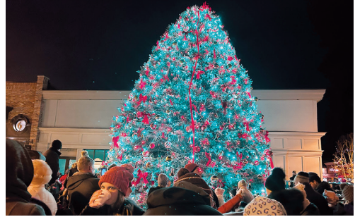
/illage Tree Lighting