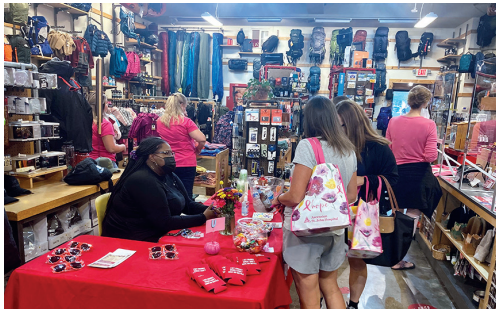
In the Pink Women's Health Even