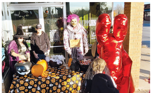
Halloween Monster Mash