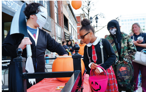
ck or Treat on the Square

Sparrow Bloom adds to shopportunities downtown