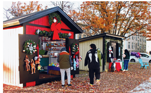
Kringle Holiday Market brings seasonal outdoor shopping