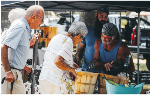
Wayland's Farmers Market