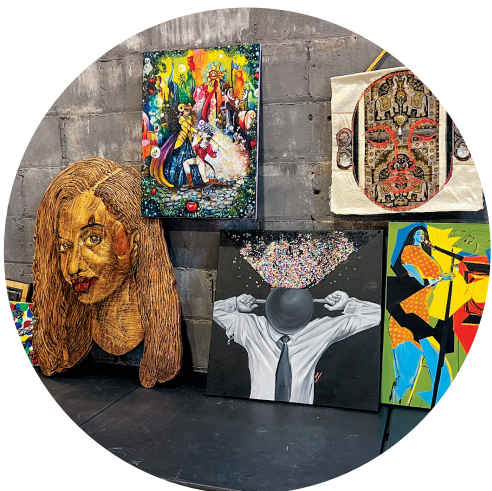
The first community-wide art crawl showcased 20 contemporary art spaces, highlighting neighborhood artists' creativity through a collaborative effort uniting studios and residents across the district.