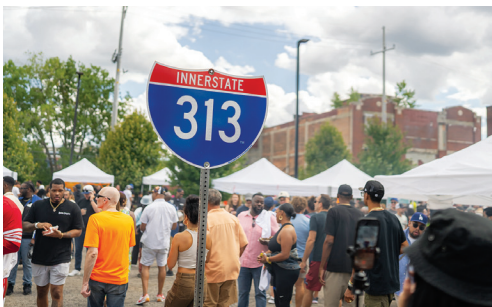
Hospitality Included Festival

“As a lifelong resident and Vanguard CDC board member, I’m proud to help drive the North End’s growth—strengthening small businesses, improving infrastructure, and advancing inclusive, long-term economic revitalization.”