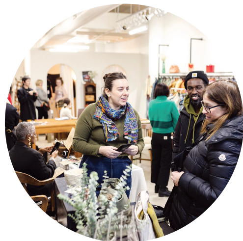
Light Up Main Street Small Business Saturday transformed our district into a winter wonderland, highlighting our vibrant business community and bringing festive cheer to the district.