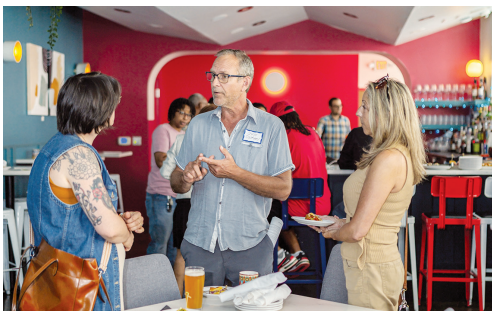
Fall North End Main Street Mixer