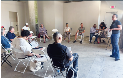
NEMJ-BDA May General Business Meeting