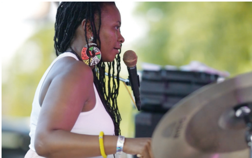
2nd Annual Women Who Drum Concert