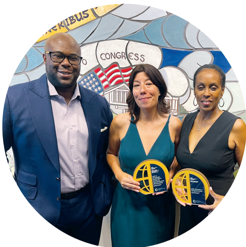
LISC Detroit and Vanguard CDC were awarded the “Community-Centered Economic Inclusion” award for neighborhood economic development from the International Economic Development Council