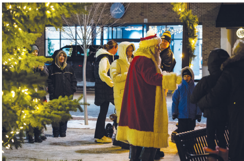
Santa arrives to light the town.

"I'm so very grateful to be part of Niles Main Street these past 25 years, shaping a lively, growing downtown full of opportunity and pride. Here's to 25 more years of bold ideas, strong partnerships, and working together!"