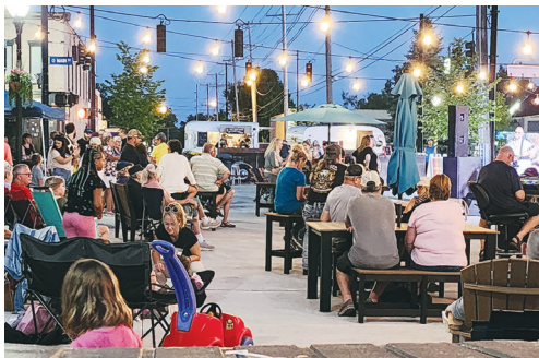
Our First NODE Festival (NXNW)