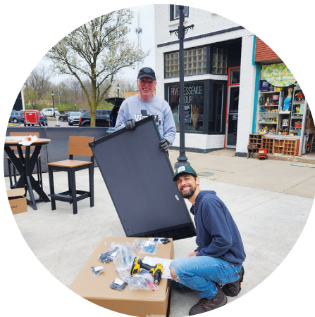
Assembling furniture for NODE grand opening!