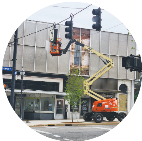
Another beautiful building being uncovered and restored.