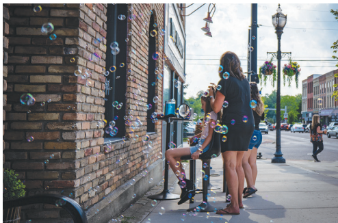
Bubbles everywhere at June's FriYay!