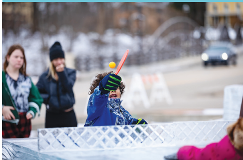
Ice ping pong, anyone? Hunter Ice Festival 2025