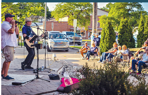
Summer Concert Series