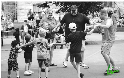
Rock the Block makes everyone dance!