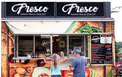
Grabbing tacos at downtown's Food Truck Tuesday.