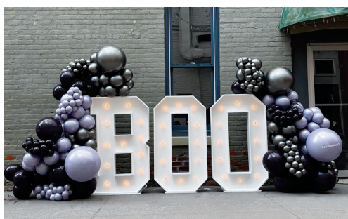
Downtown dazzles with Witches Night décor.

"Downtown Howell thrives because of the people behind our Main Street program. It's about more than events or buildings. It's all about connection, pride, and the volunteers and businesses that bring our downtown to life."