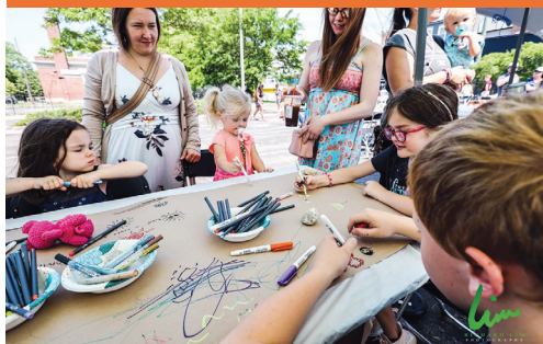
Families create together at Art in the Garden.