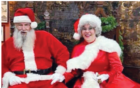
Miracle on Main Christmas Event