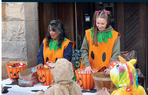
Monster Mash Trick or Treat