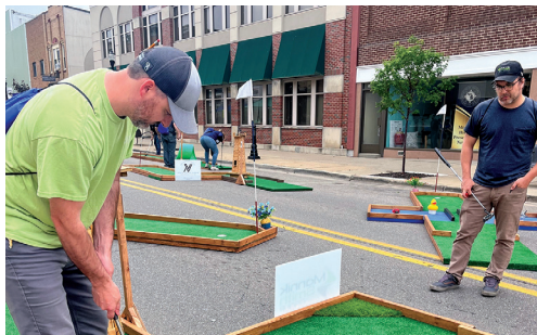
Downtown Putt Putt