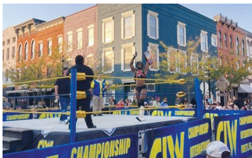
Main Street Mayhem