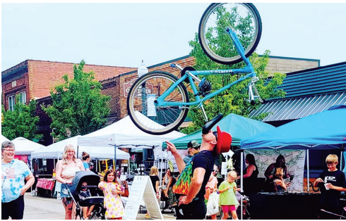
Eating Contest, Summerfest