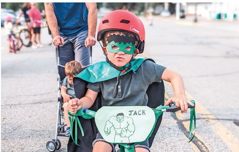
Block Party, Bike Parade