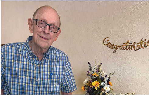
Baugh Shoe Repair 100th Celebration