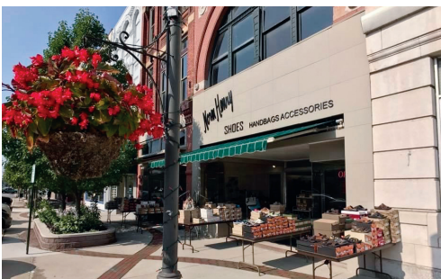
Summer Sidewalk Sales

“Main Street offers communities a system to make steady improvements to our long-term strategies which allows us to highlight our best attributes while providing valuable resources for area development yielding long-term success in municipal growth.”