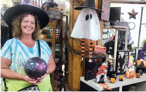
Ghoul's Night Out