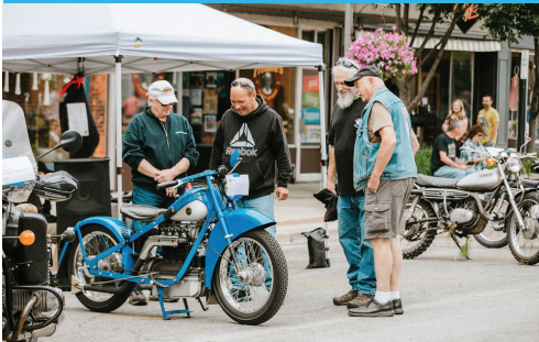
Owosso Vintage Motorcycle Days