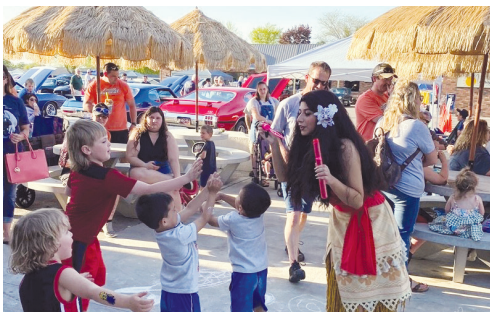
Car and Bike Show