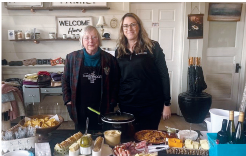
Downtown Wine Around (First Thursdays)