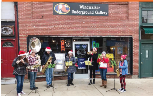
Playing for small business