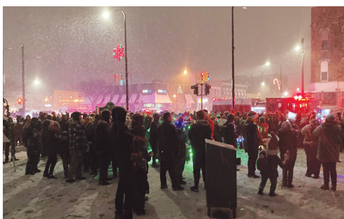
Holiday parade in all its snowy glory

“Charlotte strives to be a vibrant and competitive community. My goals moving forward are to diversify the business mix and focus on new downtown residential development, and to leverage our present Michigan Main Street program. This will involve planning for new investment, identifying assets and opportunities, and focusing our limited resources.”