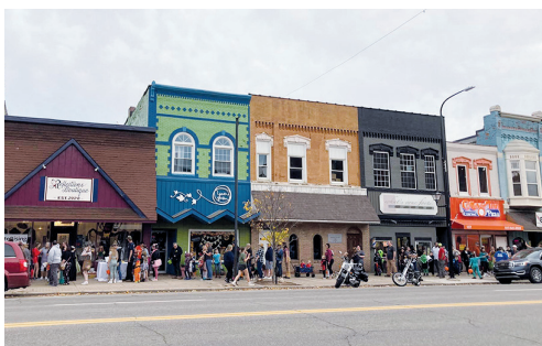
Halloween Parade of Costumes