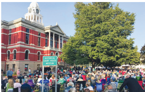
Summer Concert Series