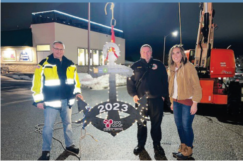
New Year's Eve Anchor Drop