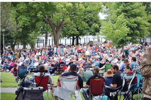
Music in the Park