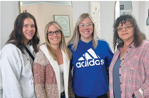
Ladies' Night Out