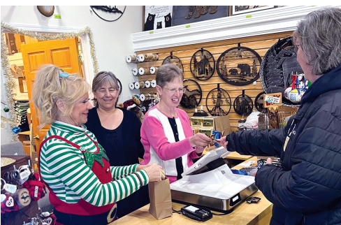
Small Business Saturday

“What I love most about the Main Street program is its ability to give back to the community. Success is built on our drive to make the downtown and the entire community a better place, where people both want to visit and reside.”