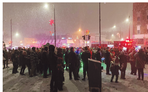
Holiday parade in all its snowy glory

"Charlotte strives to be a vibrant and competitive community. My goals moving forward are to diversify the business mix and focus on new downtown residential development, and to leverage our present Michigan Main Street program. This will involve planning for new investment, identifying assets and opportunities, and focusing our limited resources."