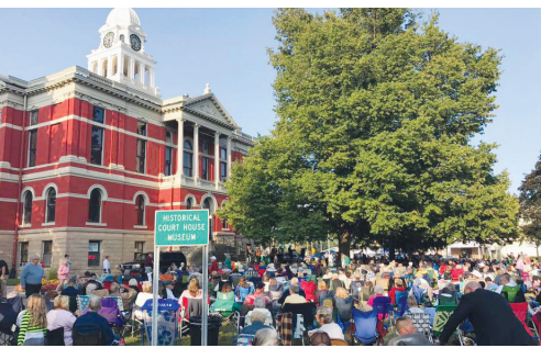
ummer Concert Series