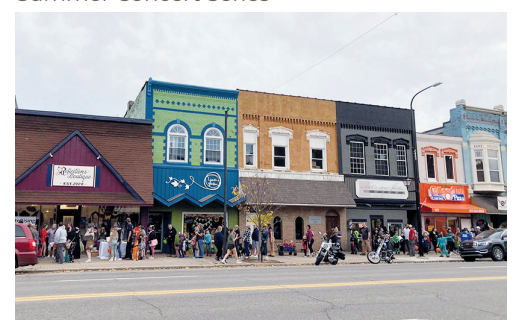
Halloween Parade of Costumes