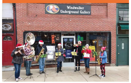
Playing for small business