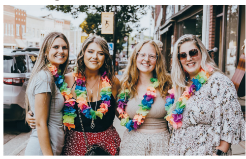
Sass in the City Celebration!