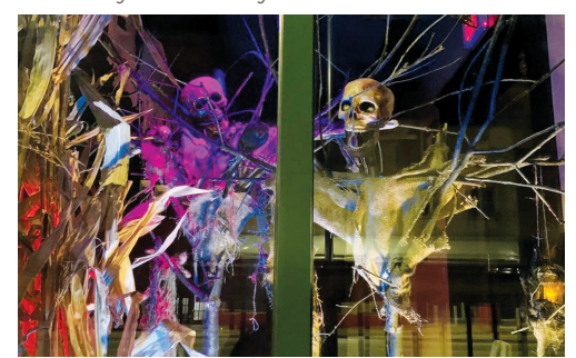
Halloween storefront decorating contest

"Our best is yet to come thanks to Michigan Main Street.