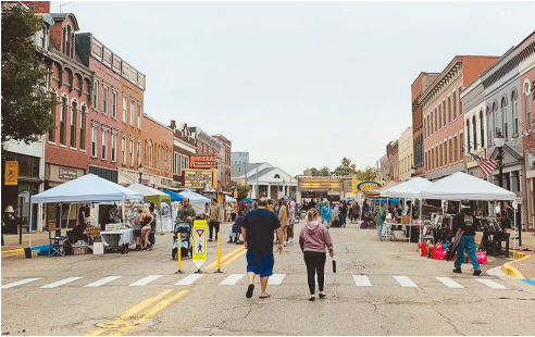
HarmonyFest—Party in the Street!