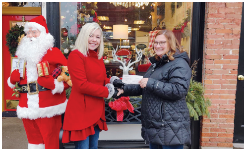
Storefront Decorating contest winner