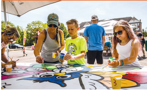
Art in the Garden attendees craft community masterpiece