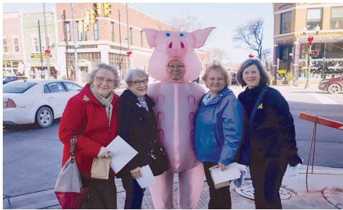
Holiday Ham celebrates Small Business Saturday