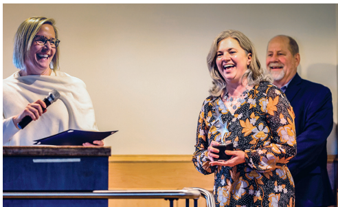
Volunteer of the Year recognized at Applause Awards

“Comprehensive support provided by the Michigan Main Street Network, including customized strategic services, educational sessions and workshops, and state-wide community-to-community networking opportunities, are vital to the success of downtown Howell and communities throughout the state of Michigan.”