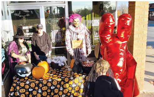
Halloween Monster Mash