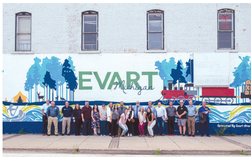
Osceola County Developer Day