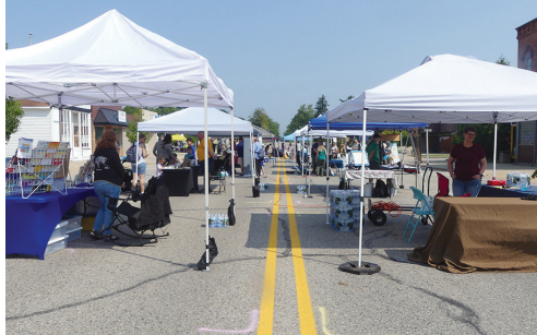
Environmental Education Expo Day 2023