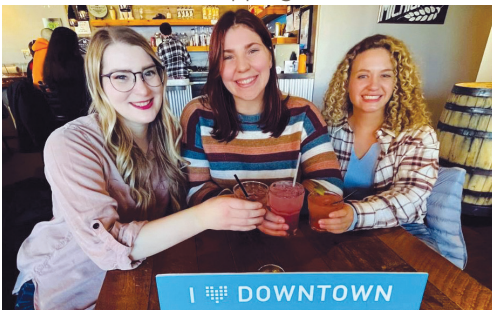
Cheers to Wine about Winter!

“The heart of Michigan’s Capital City is its downtown district. Downtown Lansing is evolving into a neighborhood and thriving urban center that fosters community engagement through our culture, opportunities and activities at all hours of the day.”