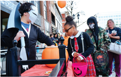
Trick or Treat on the Square