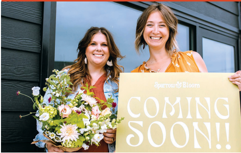
Sparrow Bloom adds to shopopportunities downtown