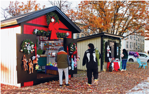
Kringle Holiday Market brings seasonal outdoor shopping