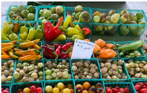
Adrian City Farmers Market