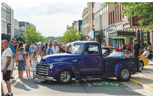
First Fridays Car Show

“Michigan Main Street is providing us with a foundation of information and services that will allow us to better support our businesses and community. We are just beginning our journey and we are already seeing the great benefits of Michigan Main Street.”