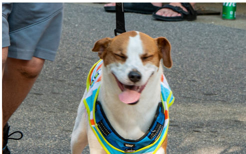
Dog Days of Summer at First Fridays