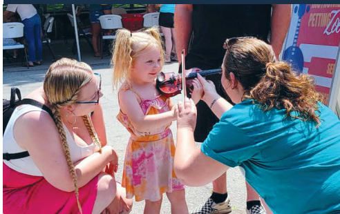
Music learning at Art-a-licious